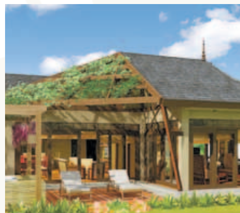
outdoor living area with sun deck

The Tiyara Casita has an ample supply of nature as it has the most spectacular views of the Cebu Strait on the east side and of the mountains of Naga on the west rendering the element of "feng shui" in every Tiyara Casita.